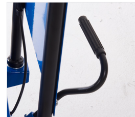
Manually operated via pump action foot pedal