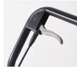
Slow release handle lowers the table