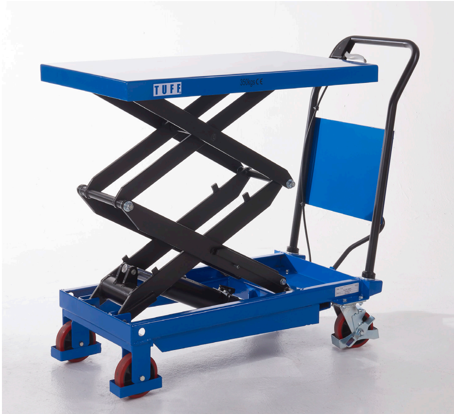
TUFF 350kg Double Scissor Lift Table